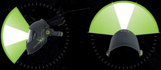
Comparing fields of view: standard ADF vs. optrel panoramaxx