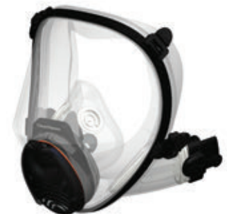
PAF-1014 FULL FACE

All CleanSpace masks can be portacount tested using the portacounter adaptors: PAF-0025 (half mask) and PAF-1015 (full face). Half Mask fit testing kits are available (PAF-0039)