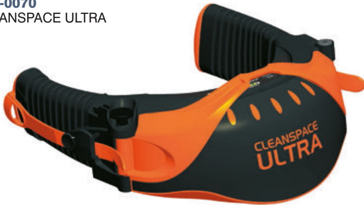
PAF-0070 CLEANSPACE ULTRA