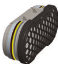
PAF-0047(AU) / PAF-0051(EU) COMBINED: ORGANIC, INORGANIC & ACID GAS & VAPOUR + PARTICULATE ABE1P3 P SL R