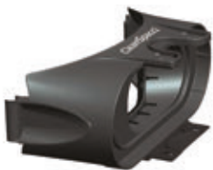
PAF-0038 FILTER ADAPTOR