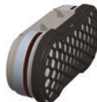
PAF-0046(AU) / PAF-0050(EU) COMBINED: ORGANIC GAS & VAPOUR + PARTICULATE A1P3 P SL R